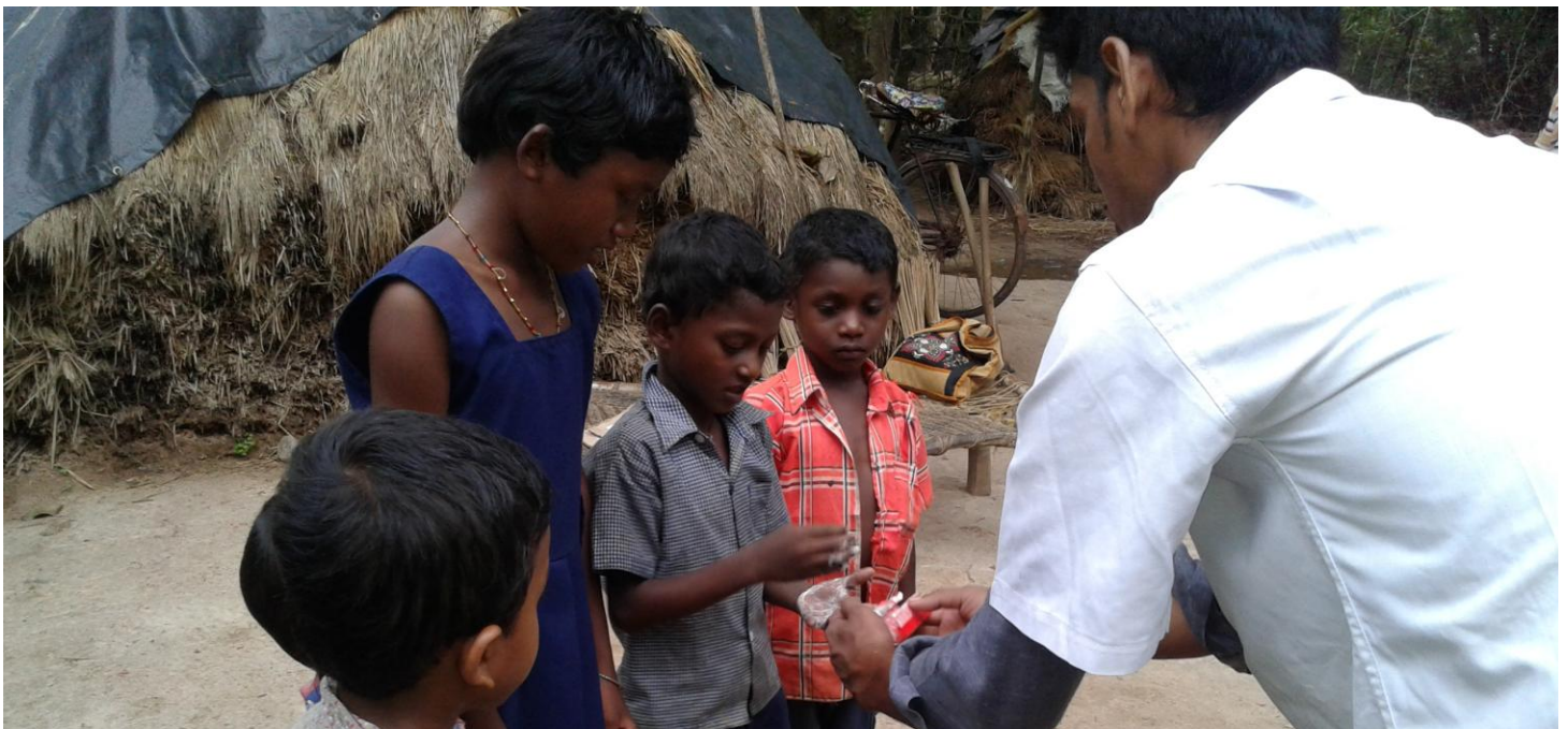
Demonstration of hand washing in “KEEP CLEAN KEEP SAFE” Campaign