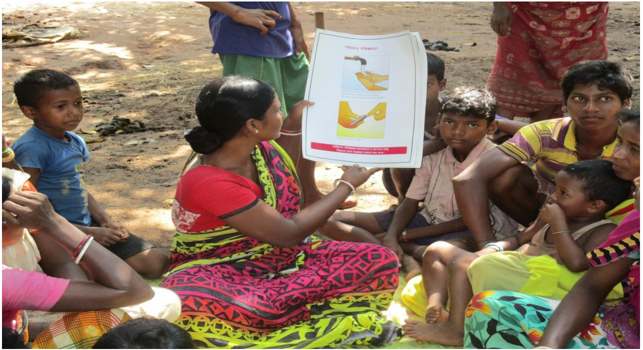
Community meetings and display of hand washing procedures by using IEC materials