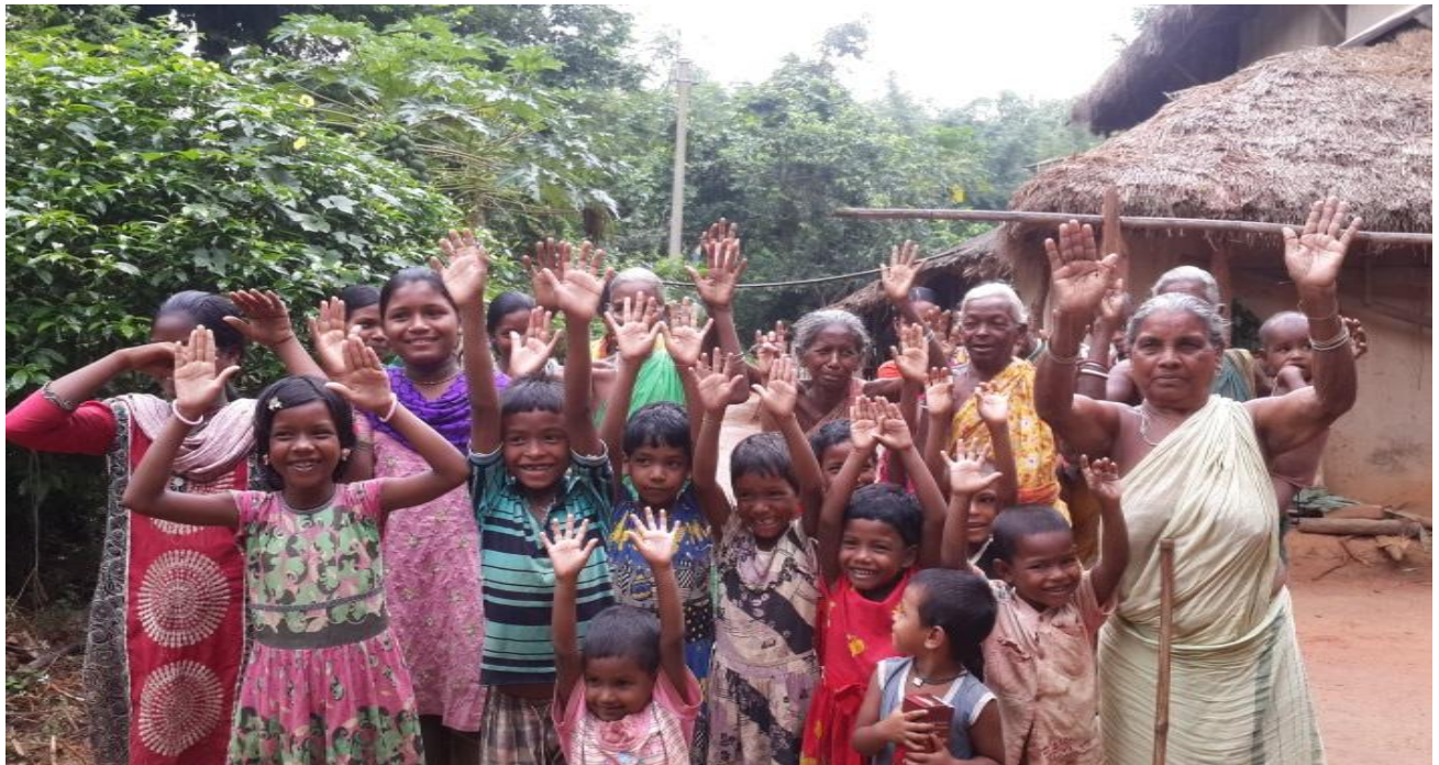
Both Adults and Children showing Their Hands after Participating Eagerly in Hand washing Session.....